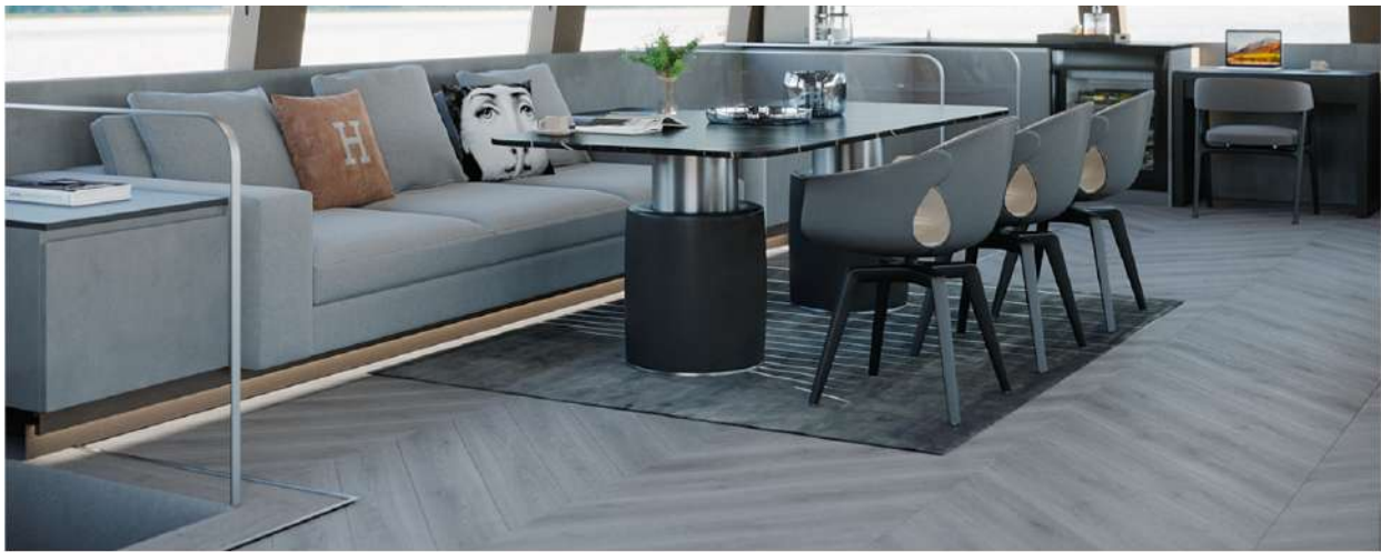
The saloon comprises dining, lounge and galley.