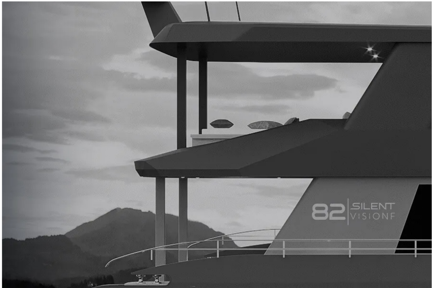
The Silent VisionF 82 is a hybrid catamaran

The new cooperation has also led to the new Silent VisionF 82, an 82ft hybrid model incorporating both conventional propulsion and renewable solar energy as Silent-Yachts helps the Turkish shipyard make its catamarans more sustainable. The model features solar panels on an extended hardtop and a powerful battery bank to power all onboard appliances, so guests can enjoy silence in a bay or marina.