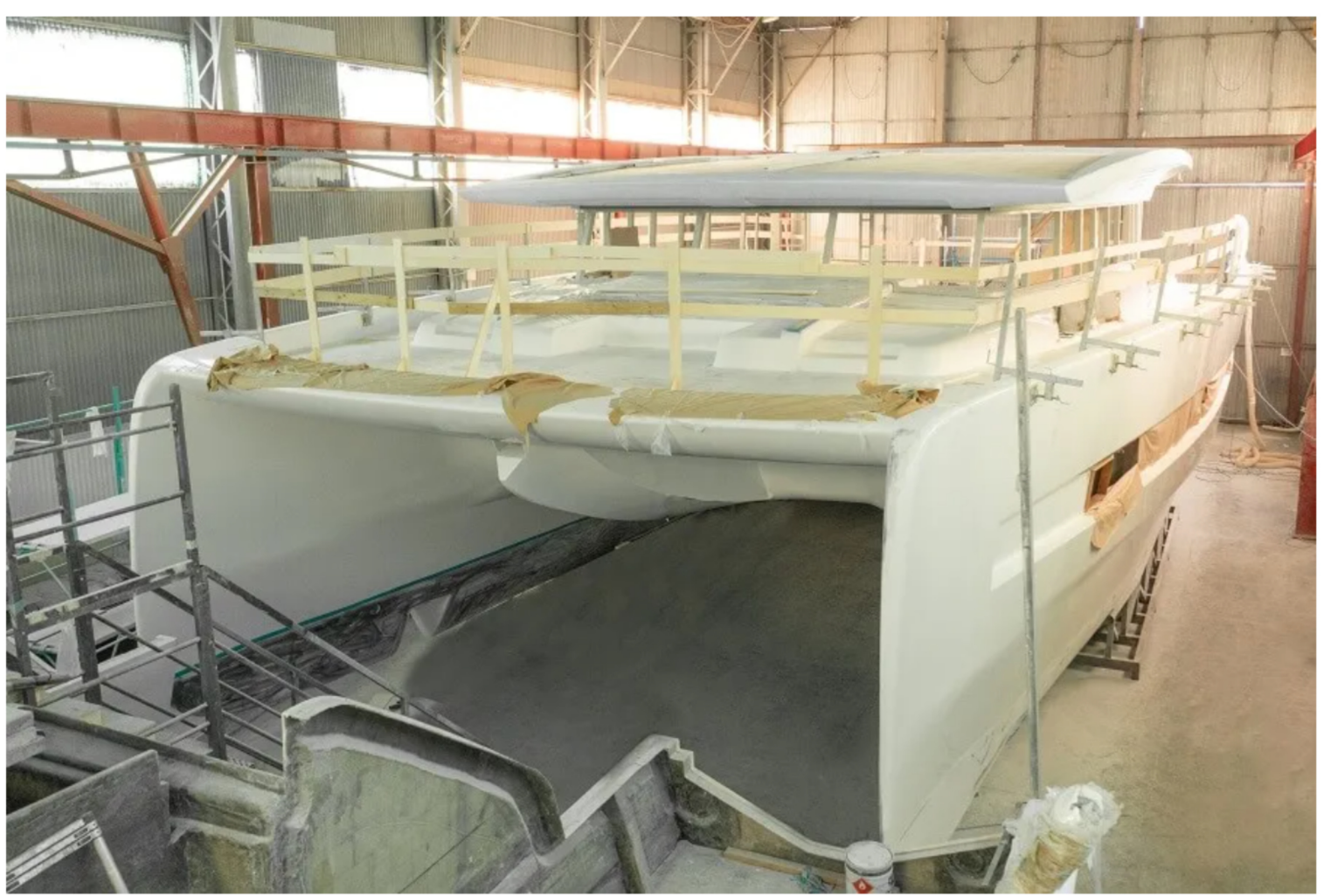
A Silent 80 in build in Fano, Italy

Silent-Brokerage offers brokerage services for pre-owned vessels for sale by Silent and its clients, while Silent-Management offers full management services for Silent clients including documentation, flag registration, certification, inspections, crew hiring, charter, yacht management and maintenance.