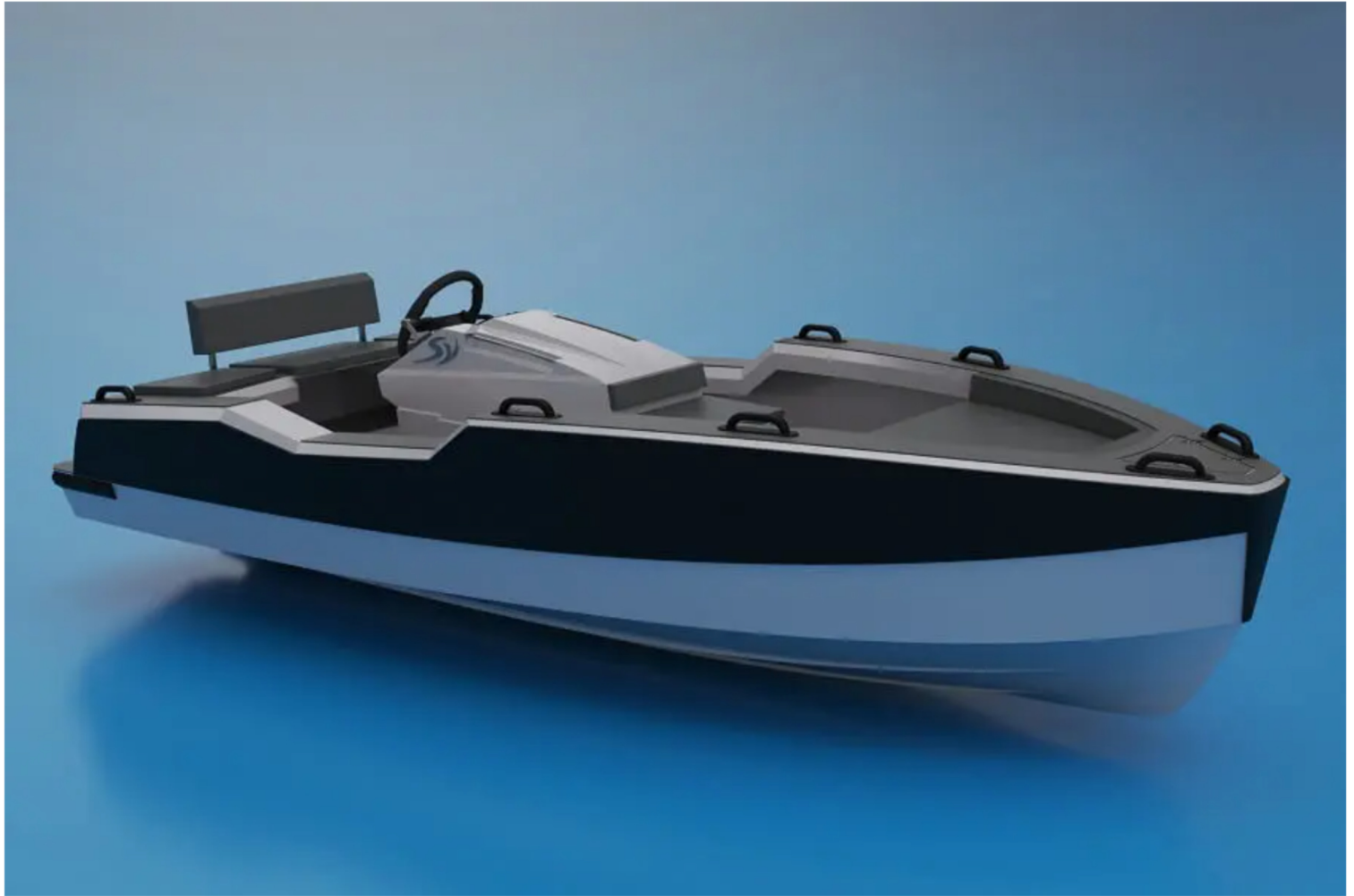
The Silent Tender 400 is a 4m electric tender