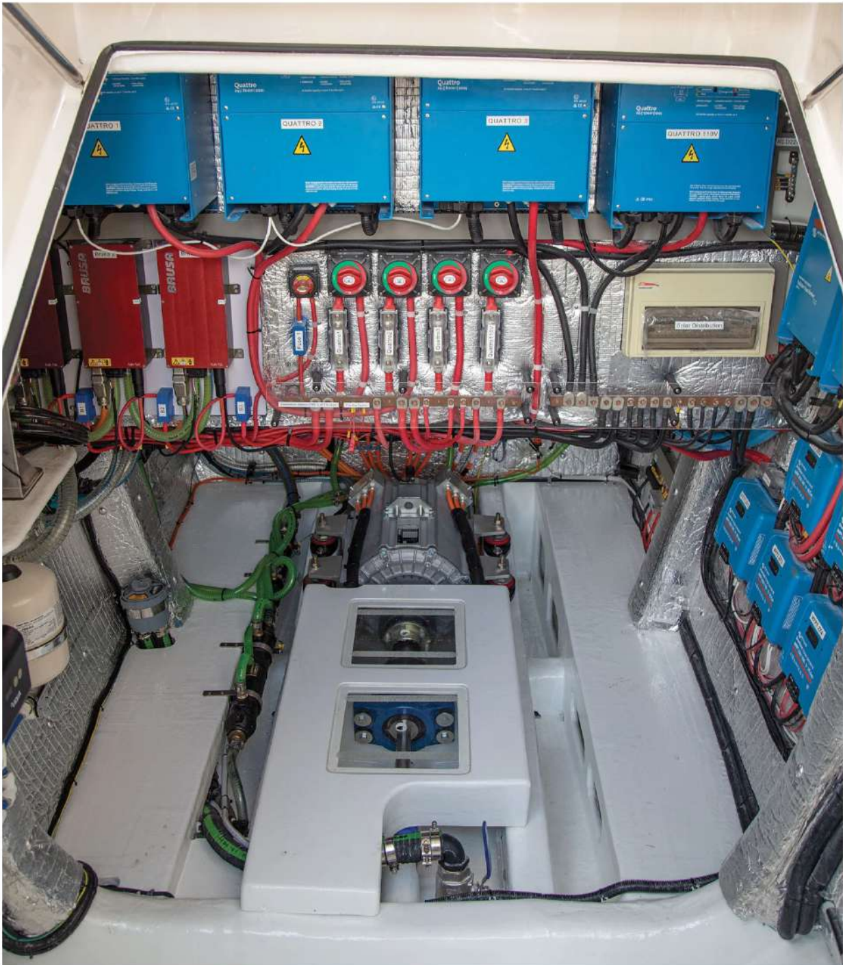
Each electric motor compartment is behind the transom steps to port and starboard.

The most notable thing to our ears as the boat began to move was noise coming through vents on both sides of the cockpit. "There is some mechanical space and engine room ventilation running, and the below-decks air-conditioning units are churning at the moment," Bell said. "Once we get some air moving through the cabin, we'll shut those down."