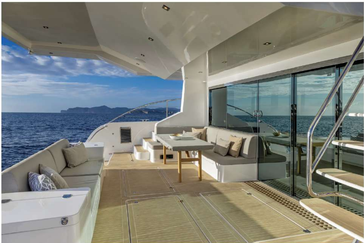
The nearly 30-foot beam creates a massive cockpit entertaining area.

“In 2009, we started on the construction of our Solar Wave 46,” Heike Köhler says. “It was the first prototype of an oceangoing yacht which used solar energy.