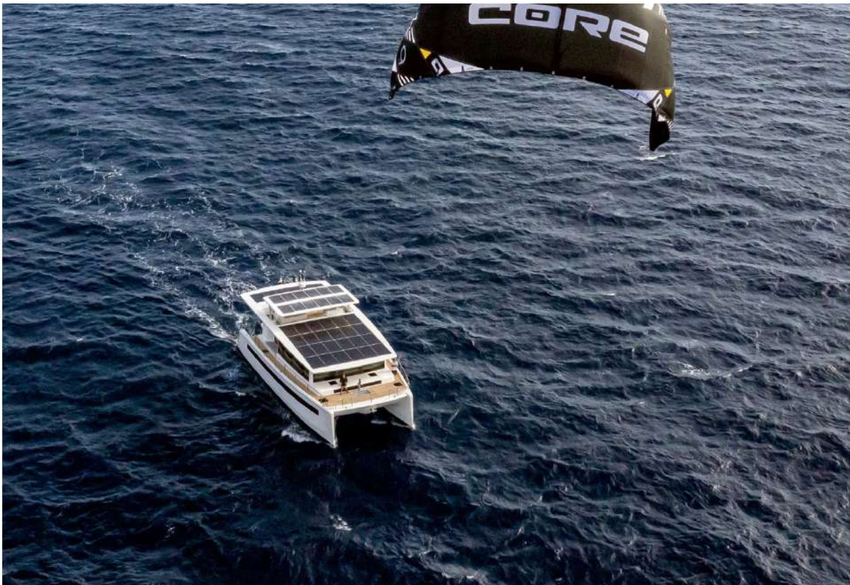
An optional kite can pull the Silent 60 along at up to 3 knots, or reduce electricity consumption.

The Silent 60's array of solar panels lines the forward and aft cabin tops, and the flybridge hardtop. It produces up to 17 kWp in bright sunshine. That equates to 17 kW of charging per hour, in ideal conditions.