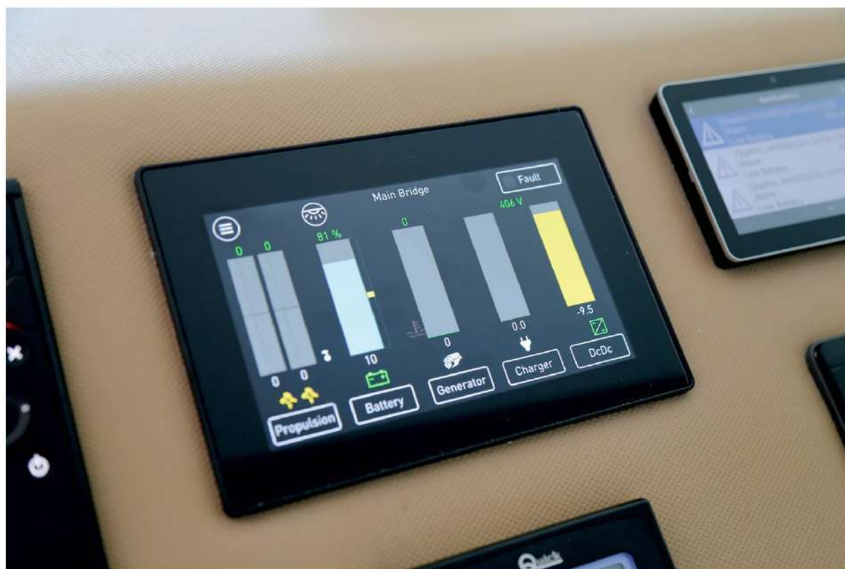
A helm display provides energy consumption and charging data in real time.