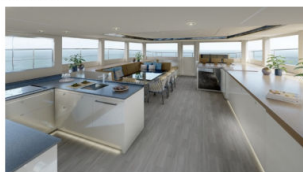
— A possible layout for the main deck interior

The closed sky lounge version provides an 18sqm enclosed interior with a bar, galley and dining table, while aft is a 32sqm terrace with sofas and lounge areas. The owner's suite version is similar, except the enclosed area contains an owner's suite with an ensuite bathroom.