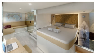
— The master cabin on the lower deck

The CE-A yacht is equipped with 42 powerful solar panels achieving up to 17kWp and the powertrain is the same as used on the 60. The self-sufficient yacht uses silent electric propulsion for unlimited range with no noise or fumes and minimal vibration, cruising up to 100 miles a day.