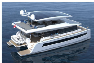
— The Silent 62 Tri-Deck has a full third deck instead of a flybridge

Silent-Yachts has already sold three units of its 62 Tri-Deck, which is based on the Silent 60 currently under construction in Thailand and Italy but with a third full deck and an extra 2ft in length. Two units of the Silent 62 Tri-Deck have been sold to clients from the US and one has been sold to Europe.