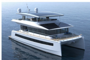
— The open sky lounge version has a 50sqm top deck

Carbon-fibre is used extensively to reduce the overall weight of the new 19m model, which has a beam of 9m (29ft 6in) and offers up to 50sqm more living space than the Silent 60, which has a flybridge.