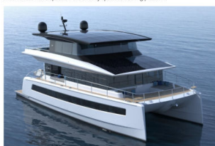
— The closed sky lounge includes an 18sqm interior that can be used for an owner's suite

"To optimise the sailing characteristics of the yacht, the hull has been enlarged by 2ft, which offers more space on the already spacious bathing platform."