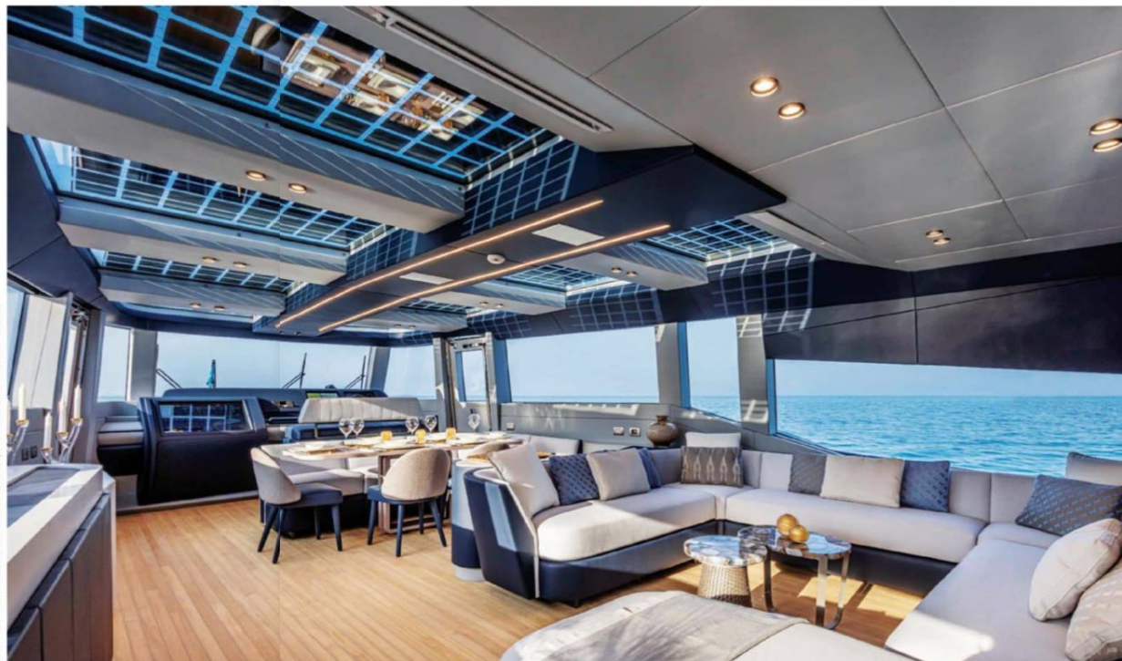
PREVIOUS SPREAD: COURTESY SILENT-YACHTS; THIS SPREAD: COURTESY FRASER