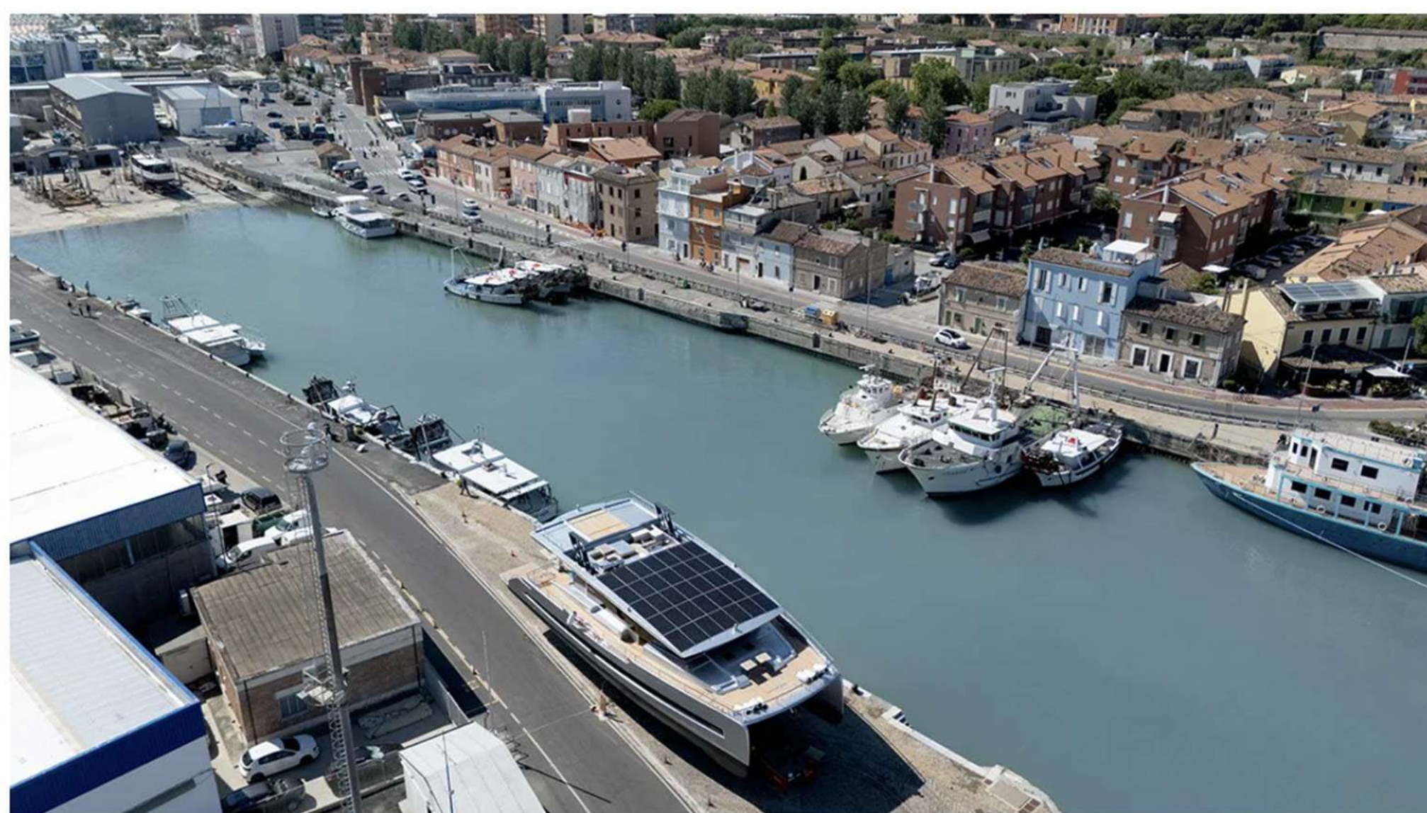
The cat leaving the Silent yard in Fano, Italy. Guerrieri Visuals

At the bleeding edge of sustainability, the cat is equipped with a solar array that can generate up to 22.4 kWp of clean power and a battery bank with a capacity of up to 696 kWh. It can traverse the seas near silently and without emissions at a cruising speed of between 7 and 8 knots and a top speed of 12 knots. The SY80 also offers that quintessential “Made in Italy” elegance and craftsmanship, according to Silent.